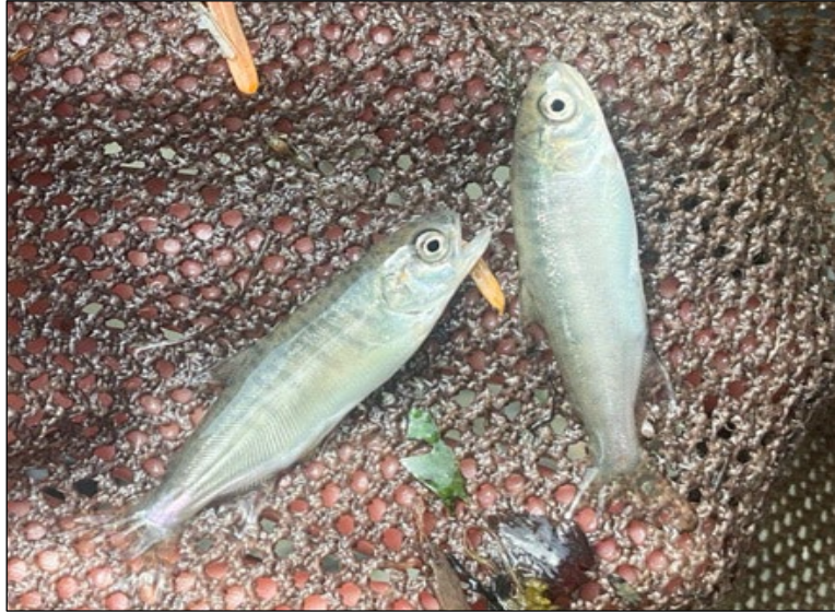
Figure 1.—Juvenile coho salmon caught at waypoint 1107.