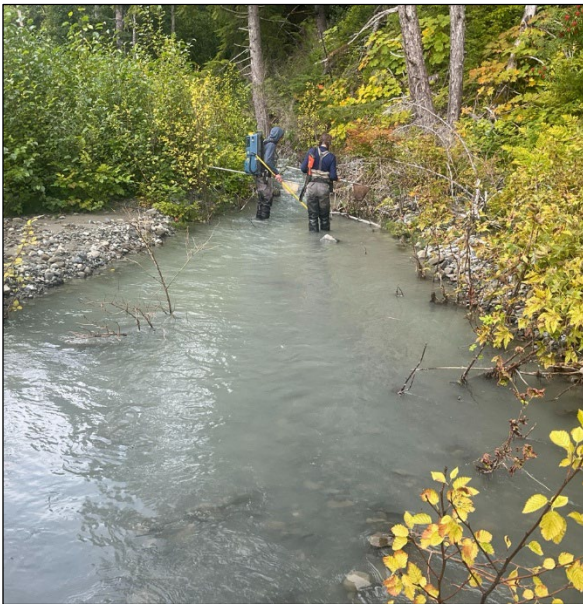
Figure 2.—Looking upstream at waypoint 1107.