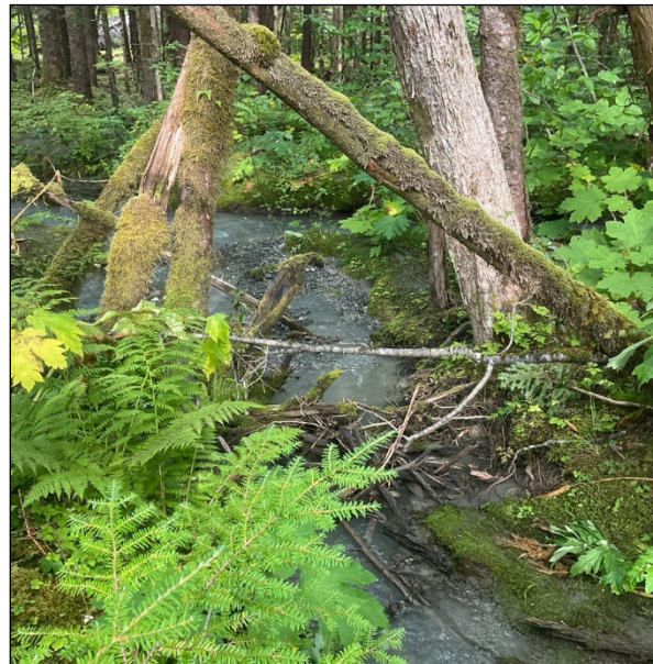
Figure 3.—Looking upstream at waypoint 1093.